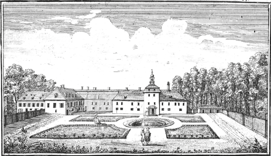
Das hochfürstliche Schloß zu Triesdorf.

The Verein der Freunde Triesdorf und Umgebung e. V. (Friends of Triesdorf and Surroundings Association) is dedicated to researching and publishing the history of Triesdorf as a hunting lodge and country residence of the Margraves of Brandenburg-Ansbach. Additionally, it focuses on the overall history of the Margraves and the neighbouring towns.